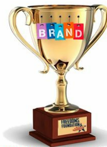
Branding Champion of the Month

The Orange County was not only one of the first to send their FY17 End of Year Report in, they also utilized our new masthead design (seen below) on their new Executive Board document.