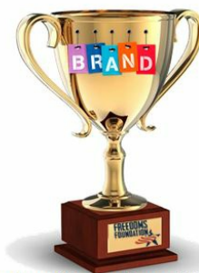
Branding Champion of the Month

The 2017 Chapter Awards were recently announced. For this reason, Brand Champions of the Month will resume in October!